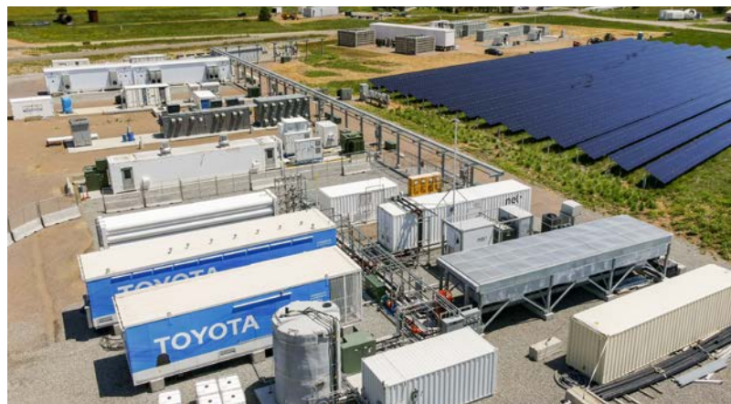
Aerial view of ARIES assets at NREL's Flatirons Campus. Photo by Josh Bauer, Bryan Bechtold, NREL 82075

Cover image: Photo from iStock 931575044, modified by Anthony Castellano